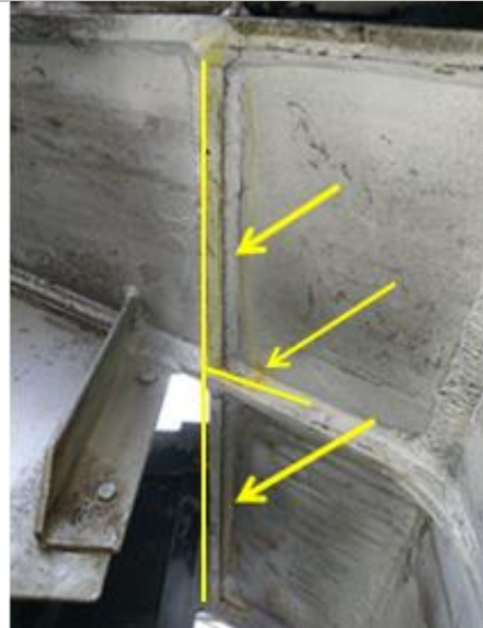
Figure 2 Cracking location