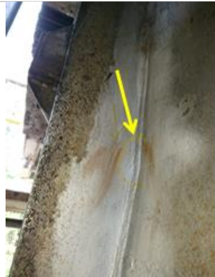
Figure 4: Weld cracking perpendicular to the main crack