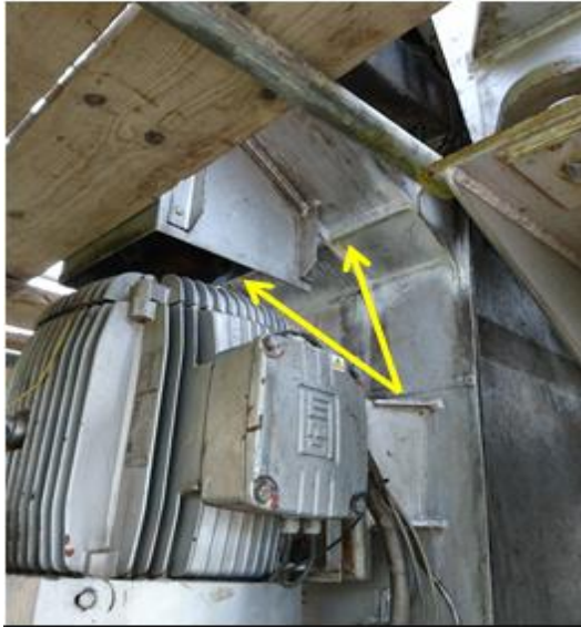
Figure 1 Cracking location