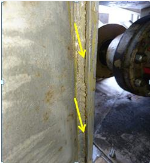
Figure 3: Cracking