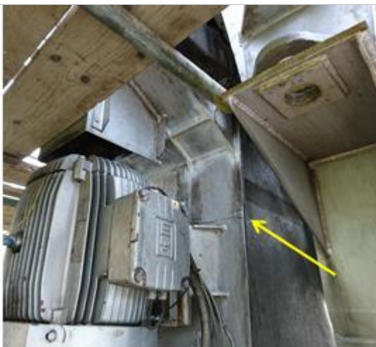
Figure 5: Location of weld cracking perpendicular to the main crack